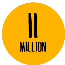
11 million girls are not expected to return to school once they reopen

Even before the pandemic, 132 million girls globally weren't in school, denied their right to an education due to their gender. COVID-19 is making things worse by rolling back years of progress on gender equality, and threatening the futures of millions more girls. The pandemic's disruptions to schooling are combining with other crises to make girls twice as likely as boys to drop out of school and to stay out. For the world's most vulnerable girls, dropping out of school leads to greater risks of exploitation, poverty, and abuse.