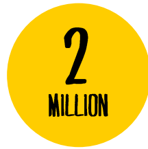
2 million more cases of female genital mutilation expected