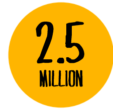
2.5 million more girls at risk of marriage before age 18